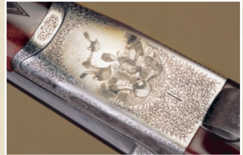
Bespoke engraving Stefano Pedretti: Italy