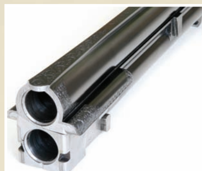
Finest Hand Made Steel Barrels