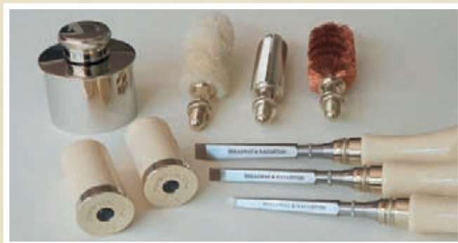
Superior hand made tools