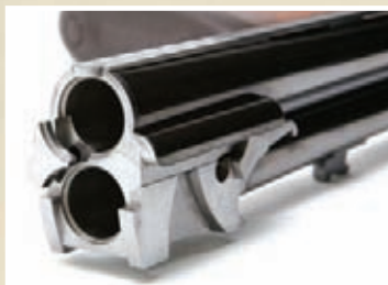
Finest steel barrels

High Pheasant model with 34" barrels is available