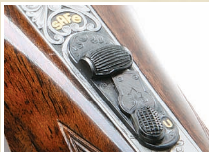
Unique barrel selector