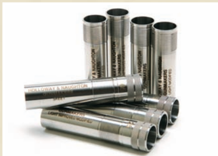
Flush and extended chokes