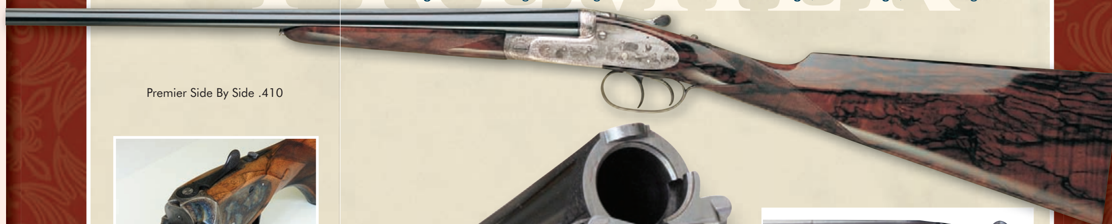
Premier Side By Side .410

Range of Best English Shotguns. Available in: 12 Gauge, 20 Gauge, 28 Gauge.