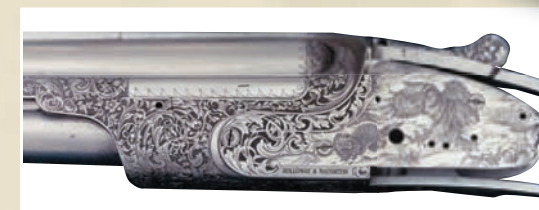
Bespoke engraving Creative Art: Italy