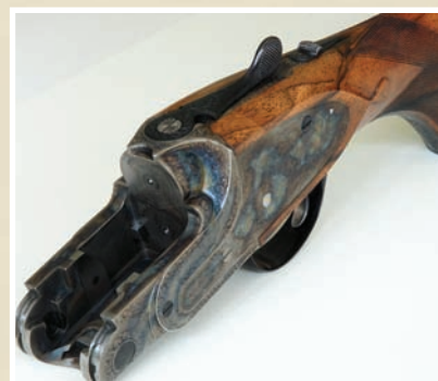
Premier Over & Under Action