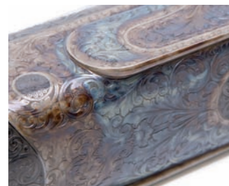
Level of workmanship is first rate in every respect.