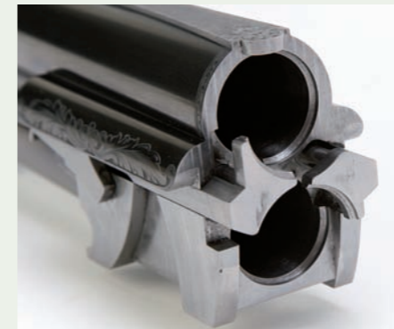
The Britannia's ejector work has been kept simple and uses design principles adapted from the Boss O/U.