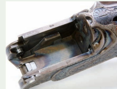
Low profile action with hinge pins and bites in line with the bottom barrel. Replaceable drawers built into the action frame ensure longevity of jointing.