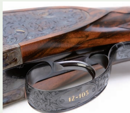
The gun is available with a choice of single or double triggers.