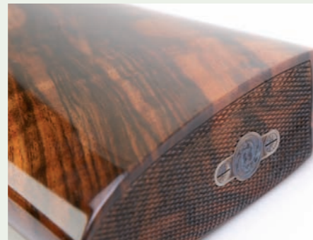
Woodwork is to a superb standard and the oil finish really does enhance the quality of the walnut. The wood is chosen by the customer.