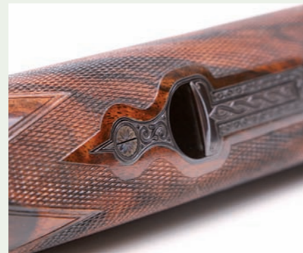
The style and shape of the stock and fore-end is down to customer choice.