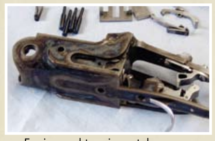
Engineered to micron tolerances.